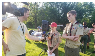
Two Troop 200 Scouts were interviewed by News 12 New Jersey.