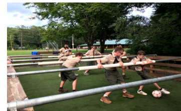
Troop 200 Scouts playing a life-size game of Foosball at summer camp.