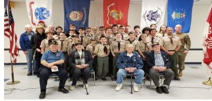
In November, in honor of Veterans Day, we invited three WWII veterans to come share their experiences with us.

A Scout is Helpful. We helped out at the Knights of Columbus Pancake breakfast. The Knights were appreciative of our hard work. In June we ran a First Aid station at a Pack 190