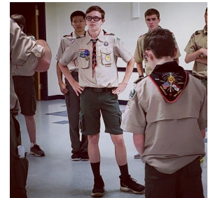
At the end of a typical meeting, the Troop circles up and the SPL leads the Scouts in the closing ceremony.