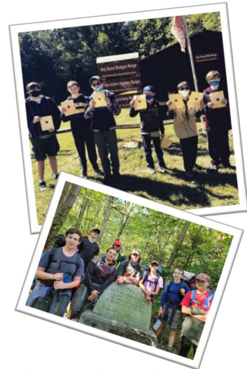
The photos above are from our trip to Hawk Mountain and the Appalachian Trail hike. The photo in the header is from our Hickory Run hike.

A few weeks ago, the scouts and scouters headed to Hickory Run State Park in White Haven, Pennsylvania. The group hiked 10 miles, camped and even encountered a bear. The older scouts in the troop will be heading to Philmont in the summer of 2021 and will be going on many hikes as they prepare for their trek. These training hikes are open to anyone in the troop who wants to get outside. While some hikes will be long distance, others won't be. Adventure is waiting – join us!